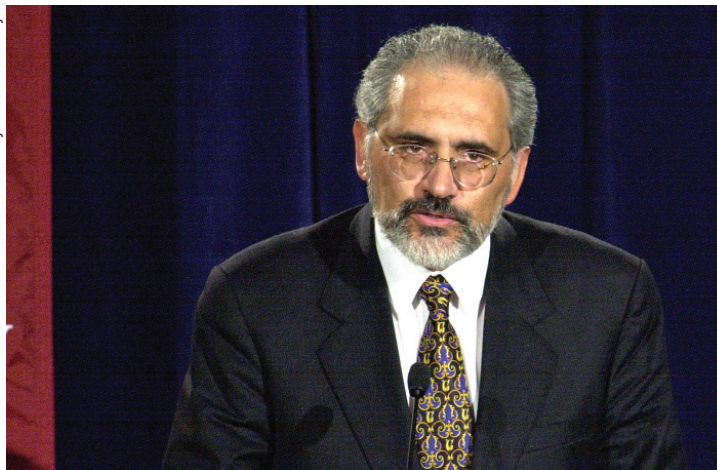
Bolivia Vice President Carlos Mesa gave his keynote speech on challenges facing his country.